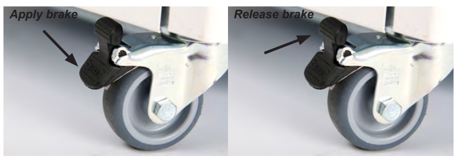
Figure 1. Steering rollers with braking mechanism