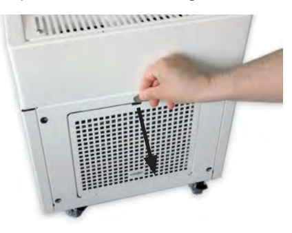
Figure 2. The front grill is mounted to the frame with two magnets (at the top).