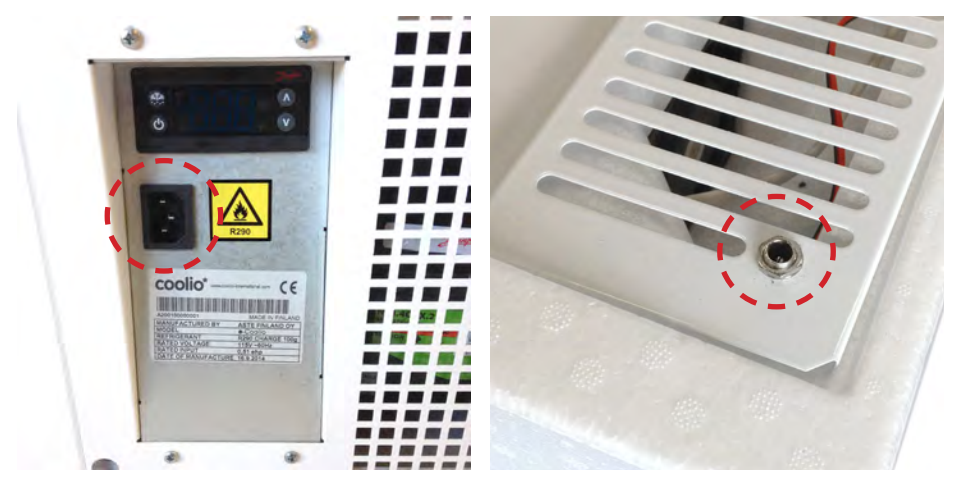
Figure 5. The main power input socket (230V) is placed on back side of e -Coolio.