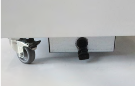
Figure 4b. Drain plug cap has a holder. Do not try to remove the cap from e-Coolio.