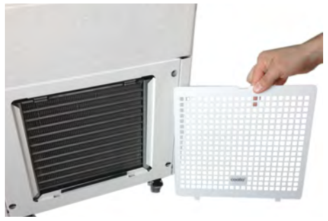
Figure 3. After removing the front grill, clean the condenser.